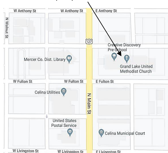
Camp Inquire 2020 Location